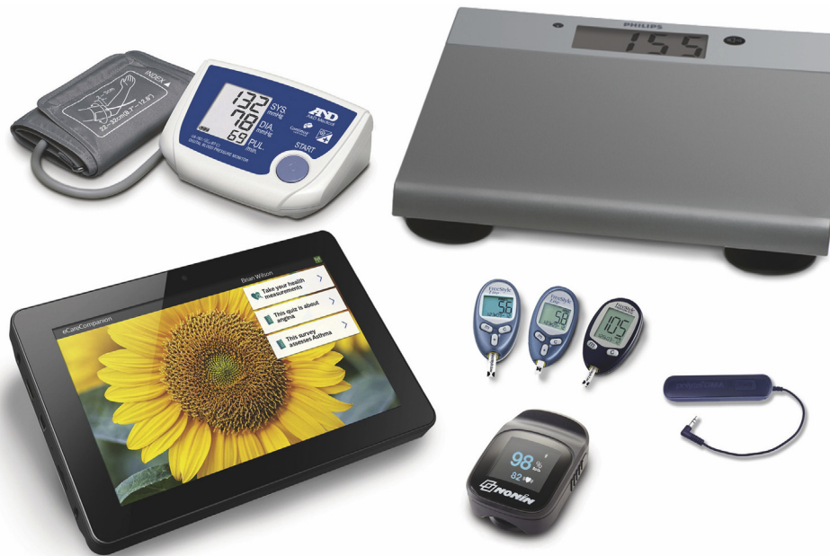
Figure 3. The Philips electronic Transition to Ambulatory Care system, featuring tablet interface and Bluetooth-enabled vital signs monitors.

undergoing noncardiac surgery. This study will be a critical step in obtaining sufficient big data to determine “signal” (ie, prognostically important physiologic precursors of post-operative hemodynamic compromise and adverse events) from “noise” (ie, benign physiologic abnormalities that do not affect prognosis). VISION-2 will allow us to potentially move beyond RAM systems driven by static hospital EWSs.