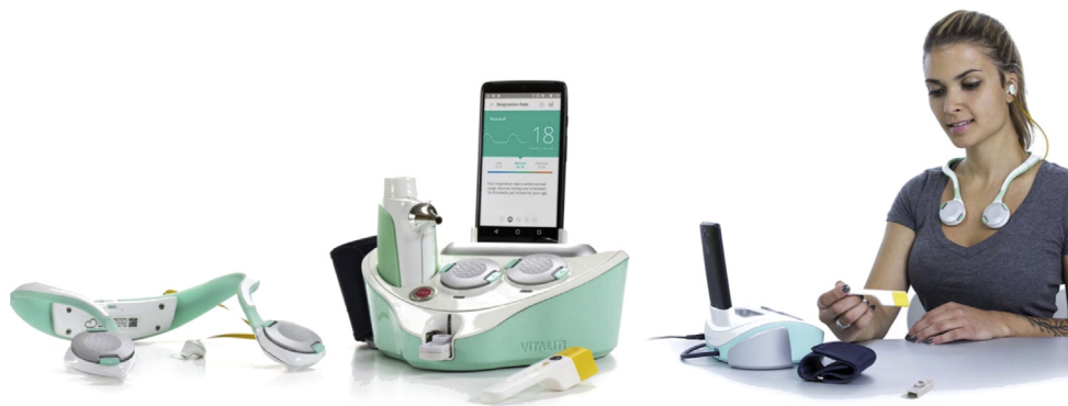
Figure 2. The Cloud DX Vitaliti multibiometric channel vital signs monitor.

insecure if not properly configured and maintained. Bluetooth is an efficient, low-power wireless communication alternative, but the theoretical transfer range of 100 m is often degraded because of physical barriers in hospitals and residential settings. Cellular capabilities allow built-in wireless transfer capabilities but could be expensive if a wearable device transfers significant amounts of raw sensor data. 24